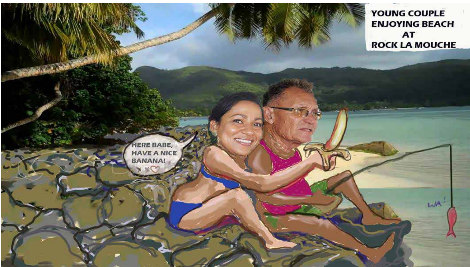
YOUNG COUPLE ENJOYING BEACH AT ROCK LA MOUCHE