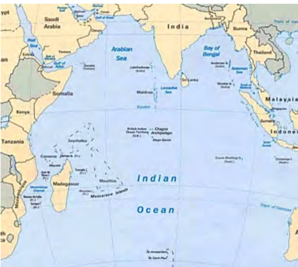
Seychelles and ASSUMPTION island fit well in the web of Indian facilities and influence in Northern Madagascar and Mozambique

Are the implications of the agreement fully understood? Is Seychelles not just a pawn on the strategic chessboard? If indeed we are, what can we do about it? Small Seychelles suddenly finds itself drawn into an arena with the two most populous countries