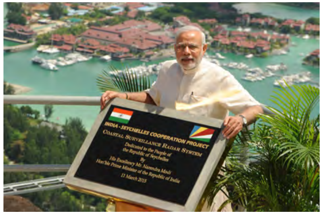
Surveillance radar system - Delivered for free?

India signed a joint defence agreement with Mozambique which included mounting of periodic maritime patrols off the Mozambique coast, supply of armaments to all the Mozambican defence services and reorganizing their military infrastructure. India is also building a high-tech monitoring station in northern Madagascar as well as negotiating with Mauritius for the lease of Agalega islands for ‘tourism’ development infrastructure. Further, India has plans to set up more Coastal Surveillance Radar Systems in Mauritius, Sri Lanka and the Maldives.