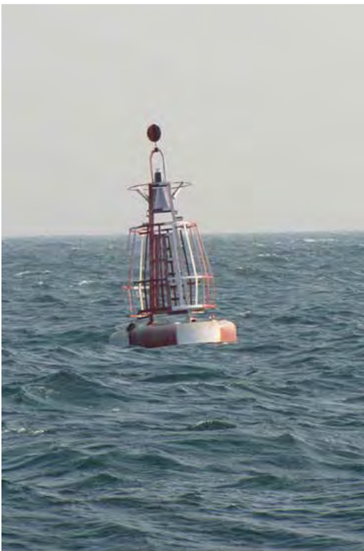
Indian Navy Buoy