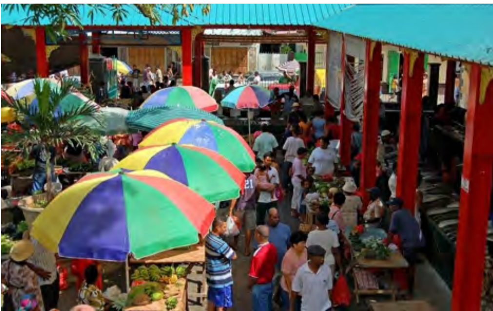
The main market in Victoria is getting overcrowded and some people are selling their items on the street.

In a bid to reduce congestion in the main market of Victoria, a temporary market will be constructed on the outskirts of Seychelles's capital, said a top official of the Agriculture Agency.