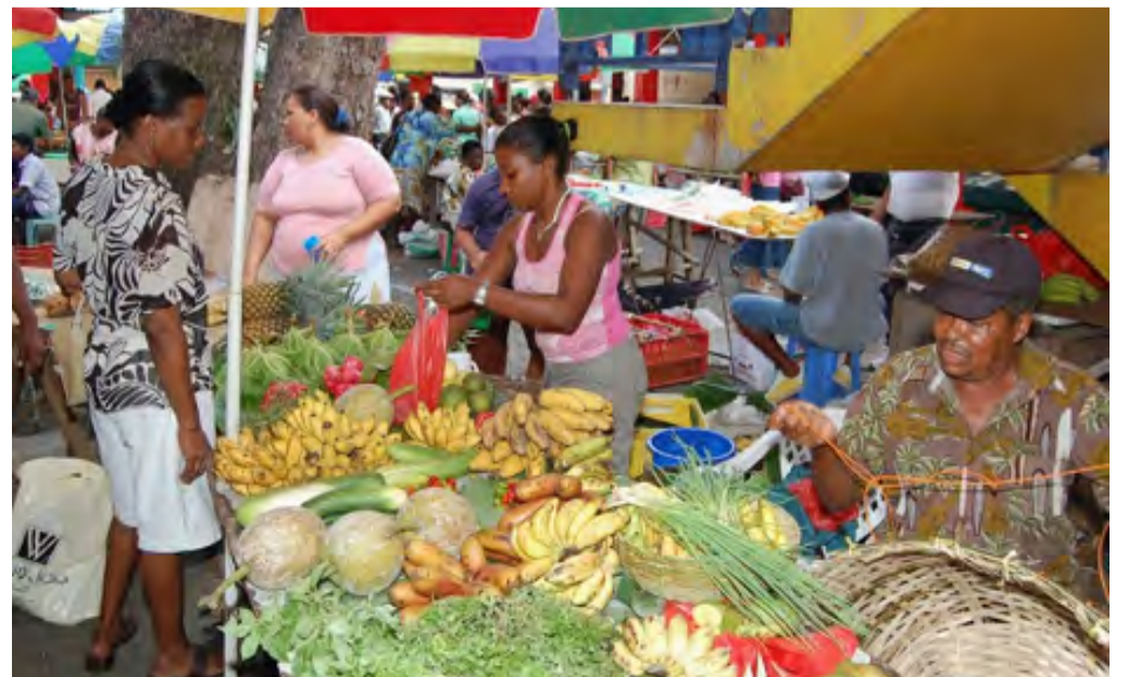
The temporary market will accommodate 28 vendors preferably farmers selling fruits or vegetables.