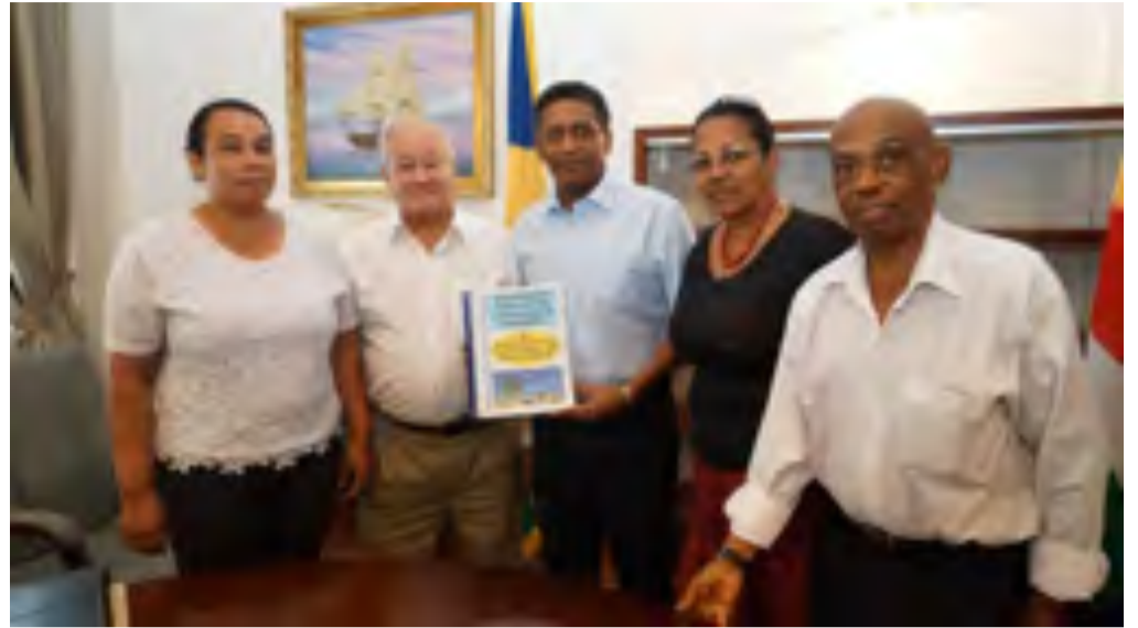
STRPP presenting its in-depth report to President Faure