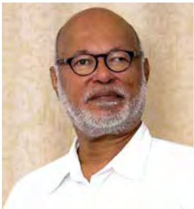
Pillay submitted his resignation letter to the office of the clerk of the National Assembly on Monday

The leader of the opposition in the National Assembly, Wavel Ramkalawan, also thanked Pillay for his personal contribution in the effort to bring about change to the country and in particular the political landscape in Seychelles.