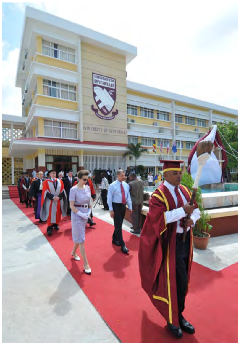
USAIM had to close down to make way for UNISEY