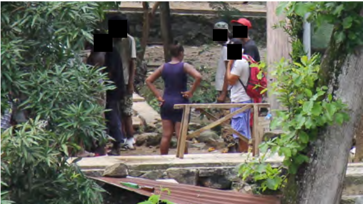
Doing their stuff freely at Corgat Estate

Many parents are frustrated with the situation especially those with addicted children; they feel betrayed. The situation is made worse with the recent deaths directly attributed to drug abuse. Does the police have any intentions of doing something to give families some sense of hope in the system?