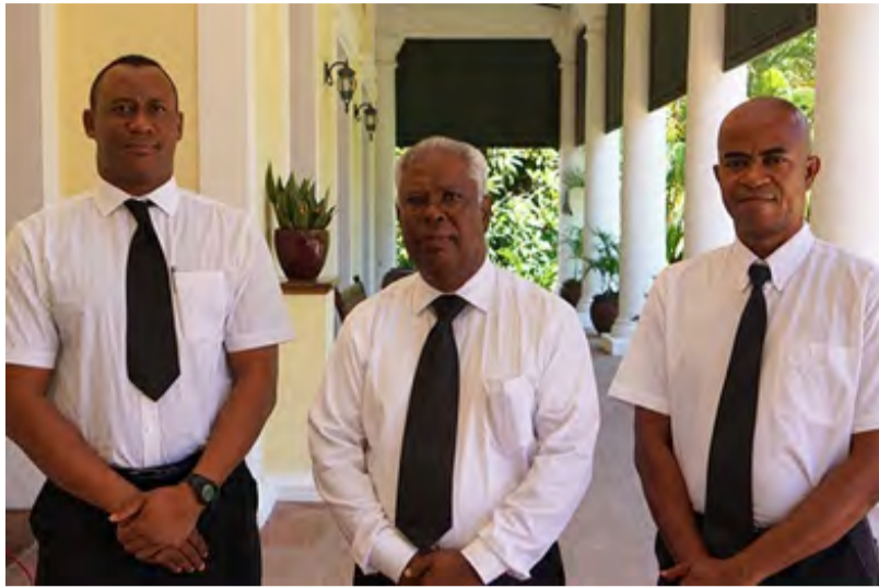
Former NDEA bosses have been elevated

The NDEA was very active in the districts making the life of drug pushers difficult though their effectiveness in apprehending traffickers was always questionable. As part of a bigger organization, it was expected the effectiveness of the Anti-Narcotics Bureau will be more visible. It does not seem that all police officers are convinced that dealing with the drug problem is part of